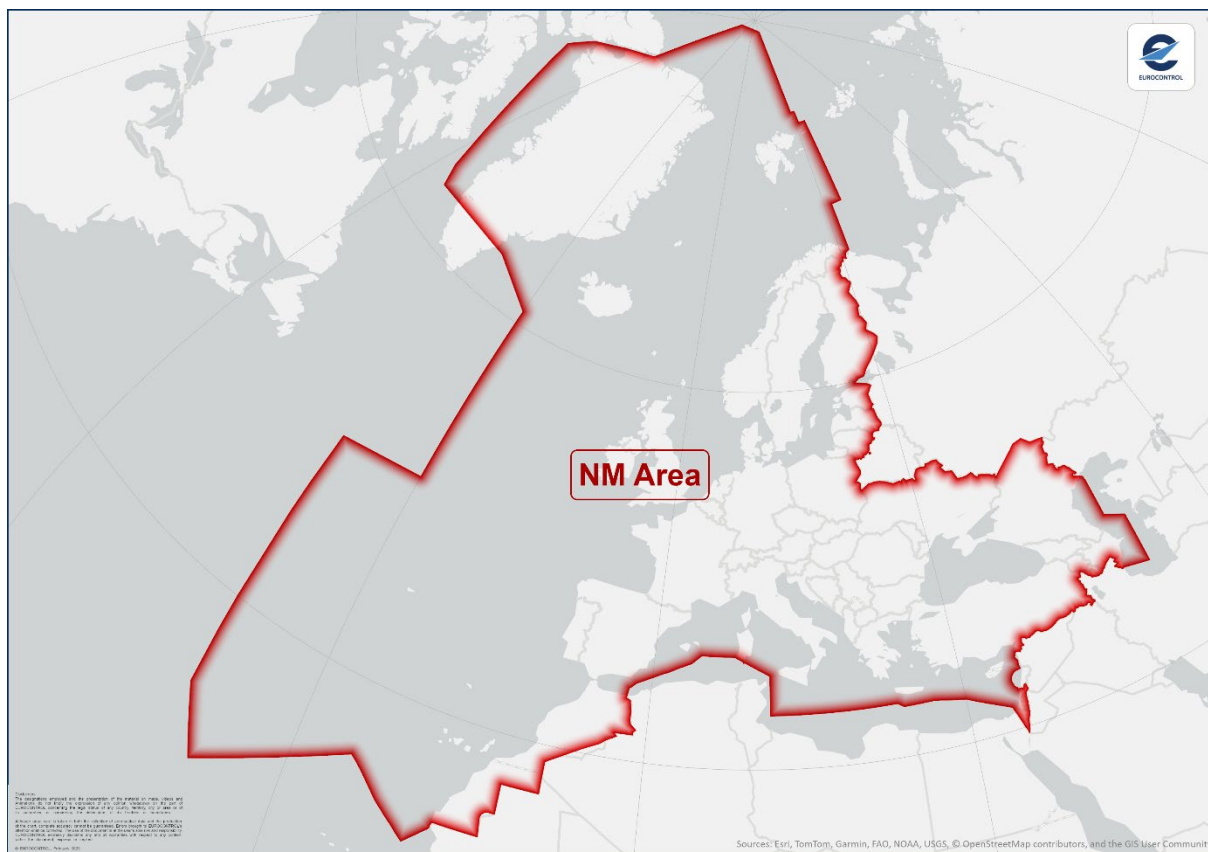
Figure 2. The EUROCONTROL Network Manager Area.

The designations employed do not imply the expression of any opinion whatsoever on the part of EUROCONTROL concerning the legal status of any country, territory, city or area or of its authorities, or concerning the delimitation of its frontiers or boundaries.