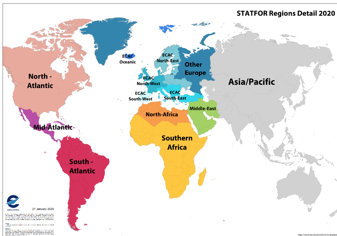
Figure 5. Map of the Traffic Regions used in flow statistics.

The map of the nine traffic regions used in our statistics is displayed in Figure 4. Moreover, ECAC region is subdivided into 5 sub-regions.