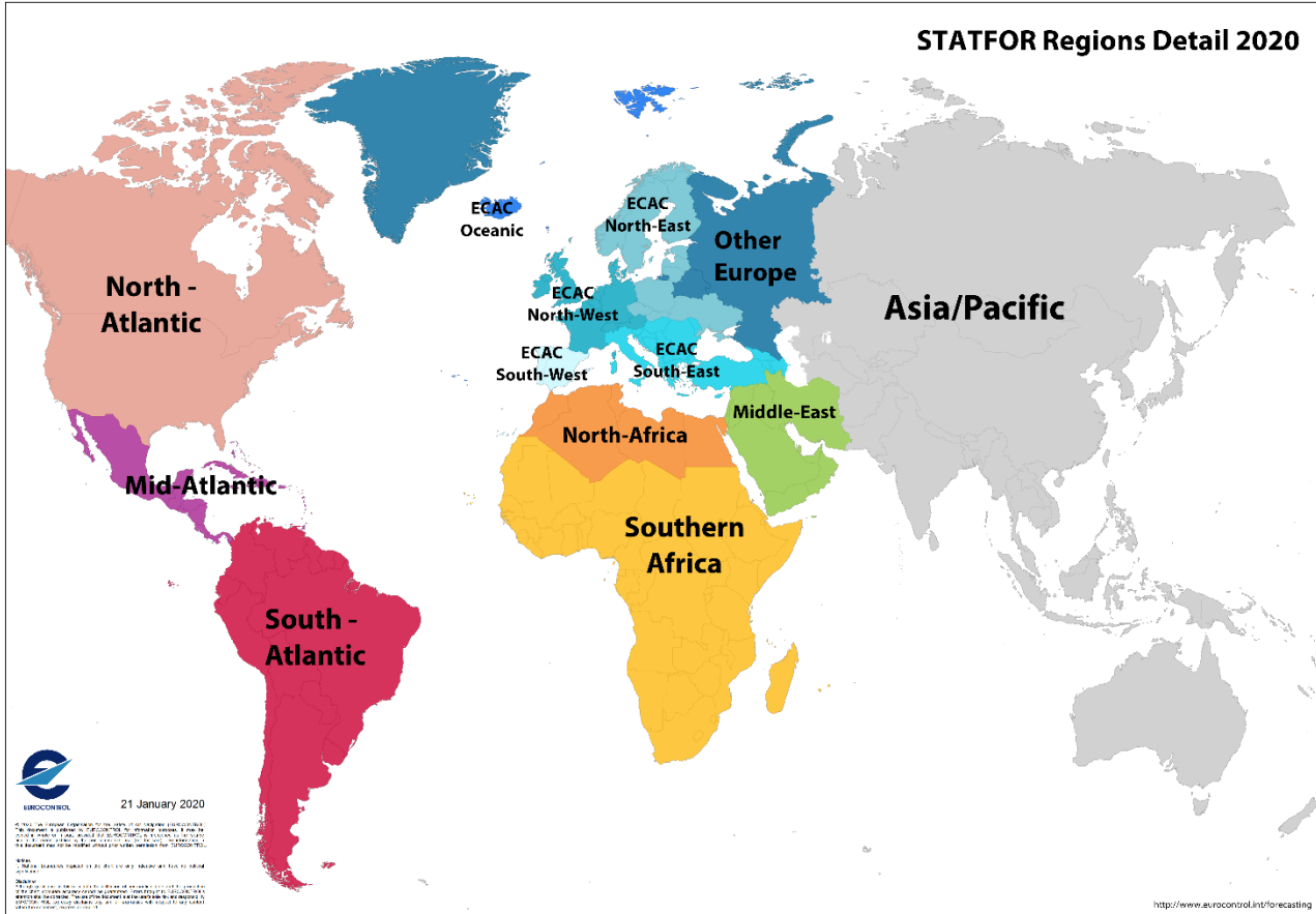
Figure 4. Map of the Traffic Regions used in flow statistics.

The map of the nine traffic regions used in our statistics is displayed in Figure 4. Moreover, ECAC region is subdivided into 5 sub-regions.