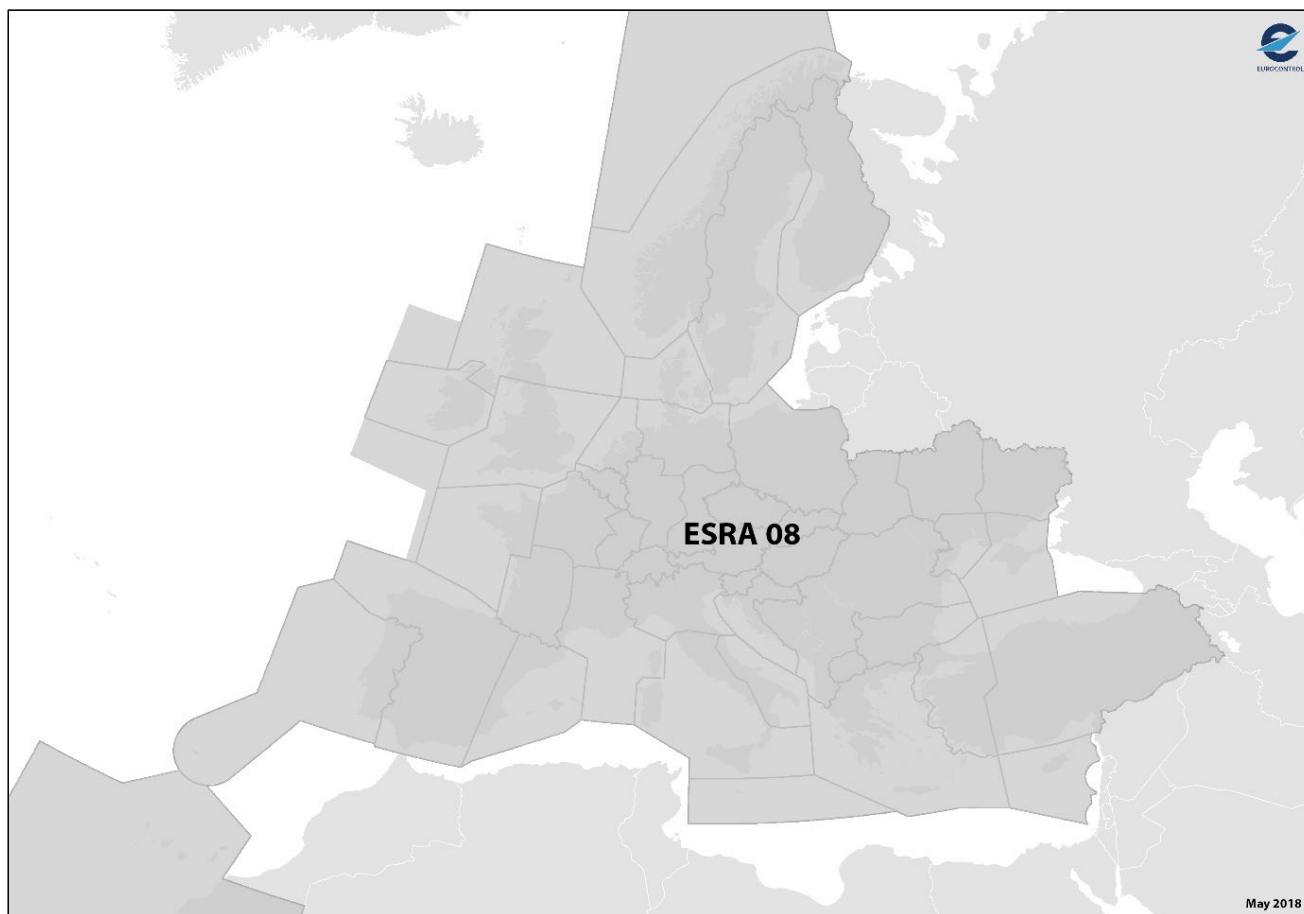
Figure 2. The EUROCONTROL Statistical Reference Area.

The designations employed do not imply the expression of any opinion whatsoever on the part of EUROCONTROL concerning the legal status of any country, territory, city or area or of its authorities, or concerning the delimitation of its frontiers or boundaries.