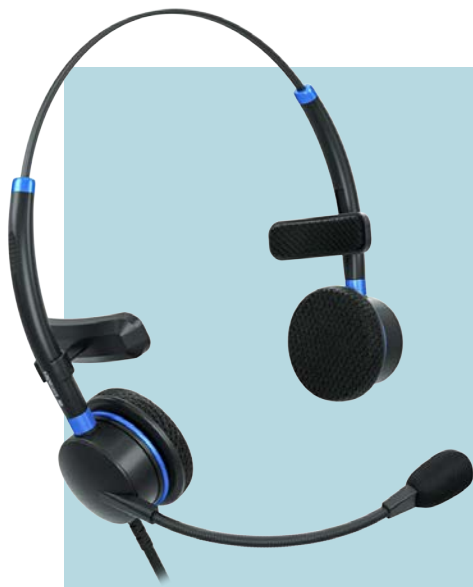
AirTalk 5000 headset