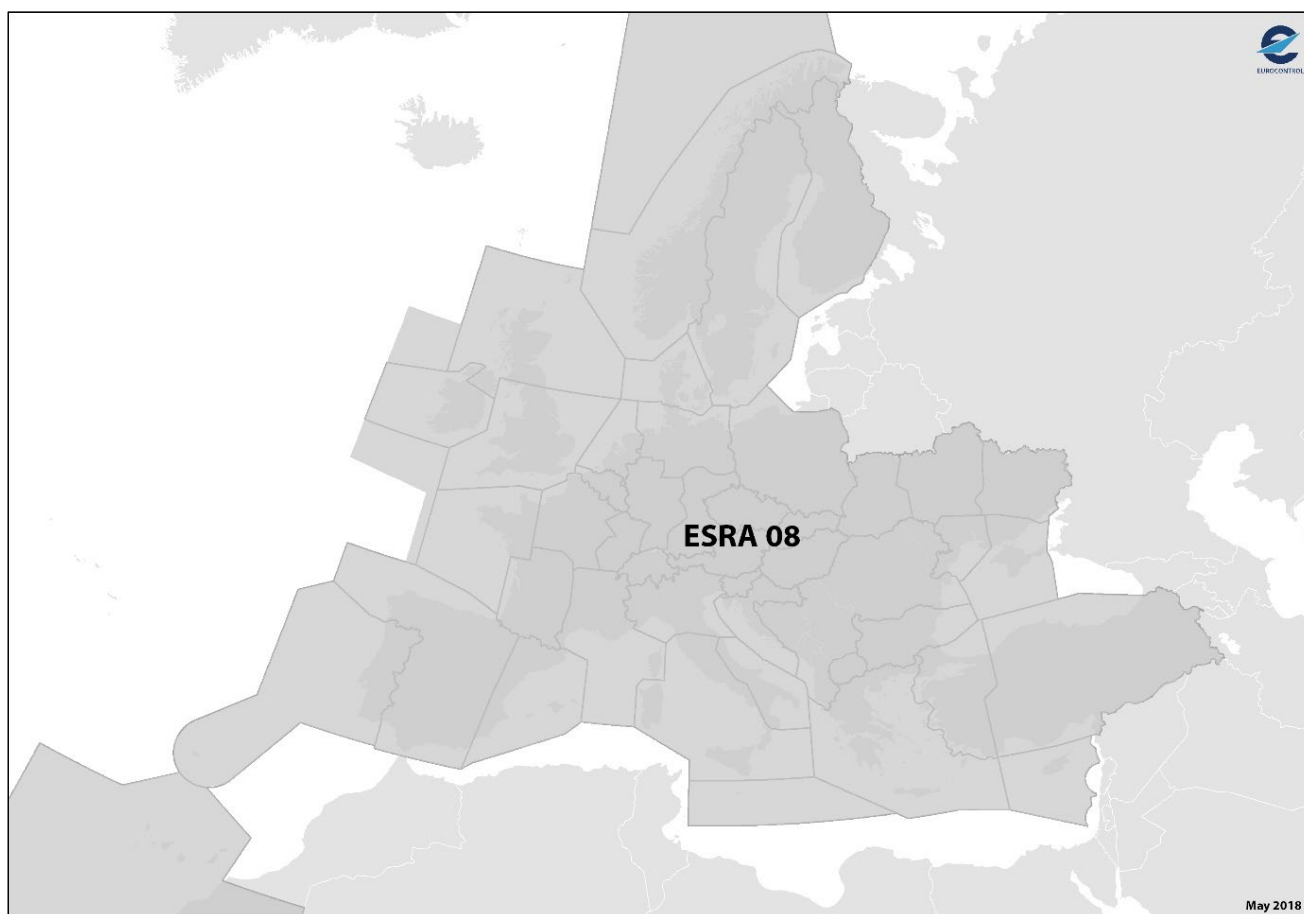
Figure 2. The EUROCONTROL Statistical Reference Area.