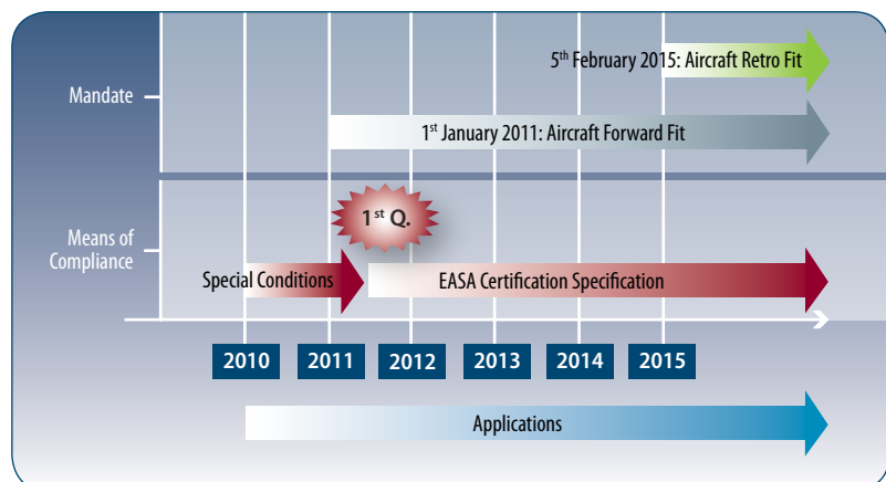
Figure 3: The EASA Timeline

Which case will apply depends on the date of an application by an Airspace User. Once EASA responds to the first applicant, that case will define the Special Condition to be applied to all applicants before the EASA Certification Specification is published.